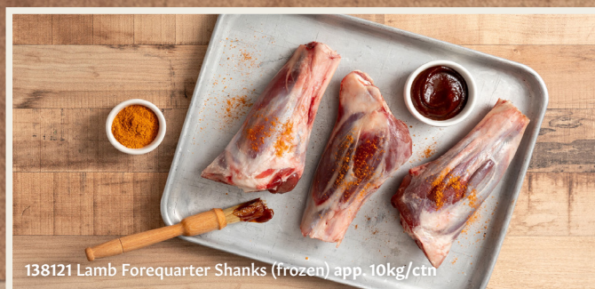
138121 Lamb Forequarter Shanks (frozen) app. 10kg/ctn