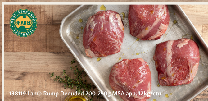
138119 Lamb Rump Denuded 200-250g MSA app. 12kg/ctn