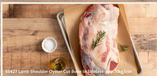
55427 Lamb Shoulder Oyster Cut Bone In Skinless app. 11kg/ctn