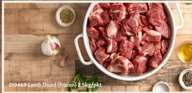
219469 Lamb Diced (frozen) 2.5kg/pkt