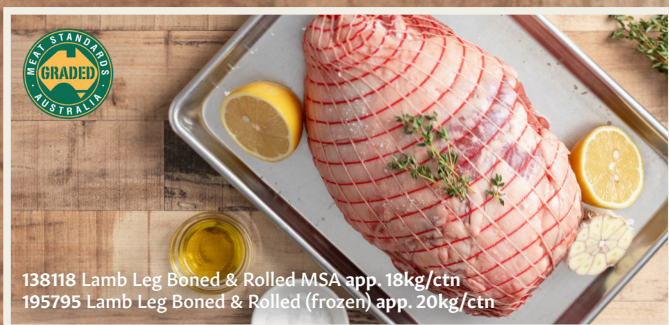
138118 Lamb Leg Boned & Rolled MSA app. 18kg/ctn 195795 Lamb Leg Boned & Rolled (frozen) app. 20kg/ctn