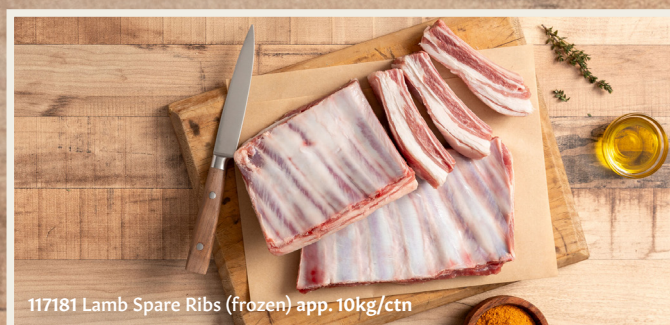
117181 Lamb Spare Ribs (frozen) app. 10kg/ctn

To place an order or for more information, contact your local Bidfood branch or log on to myBidfood.