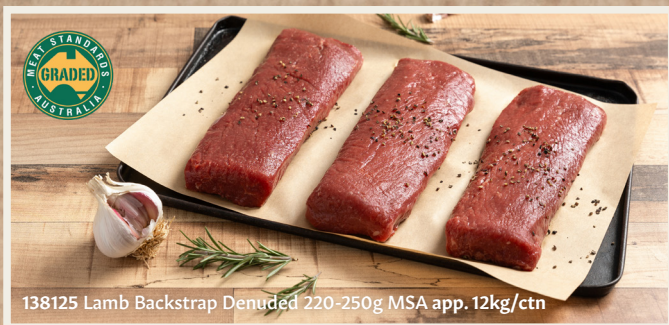
138125 Lamb Backstrap Denuded 220-250g MSA app. 12kg/ctn