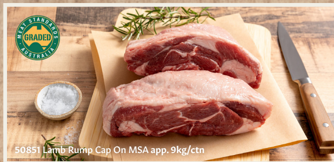
50851 Lamb Rump Cap On MSA app. 9kg/ctn