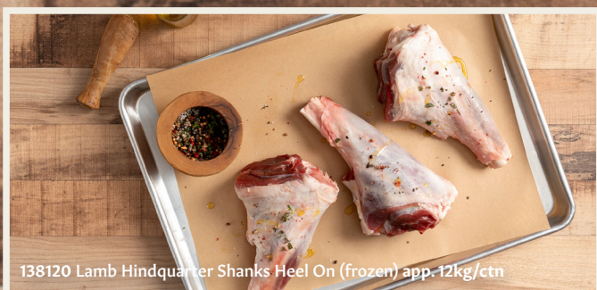
138120 Lamb Hindquarter Shanks Heel On (frozen) app. 12kg/ctn